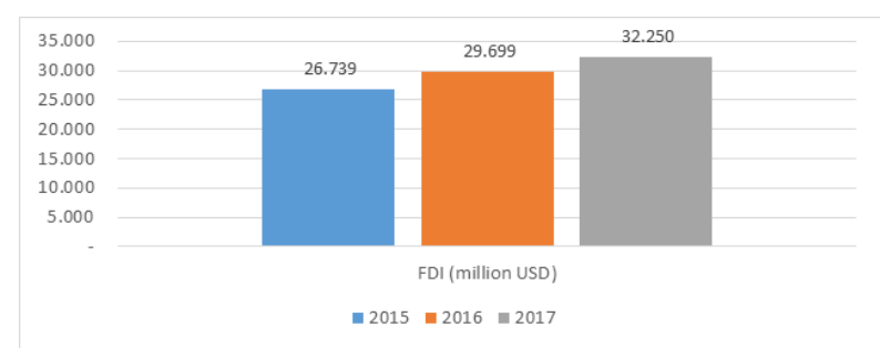
Table 1. Data on FDI in Indonesia

For the last 3 (three) years the Investment Law, has experienced a "positive trend", in which the target of inward FDI has been increasing each year. The inward FDI in 2017 has reached Rp430.5 trillion. In 2017, the FDI acceptance rate has exceeded the inward FDI target of 100.3% (from the target of Rp429 Trillion). While in 2016, the target has reached Rp396.5 trillion, also exceeded the achievement target of 102.7%: